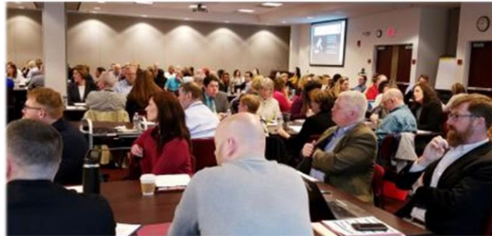
Figure 3 - Adult Drug Court Performance Measures Training Over 160 adult drug court practitioners from 20 operational and planning teams learned more about the research behind the Adult Drug Court Performance Measures.

The curriculum was designed to give adult drug court teams (judges, coordinators, state's attorneys, defense attorneys, treatment providers, probation, and law enforcement) the tools they need to manage their programs effectively. Performance measures provide timely information about key aspects of drug court performance to program managers and staff, enabling them to identify potential problems and, if warranted, to take corrective actions as well as to identify effective practices.