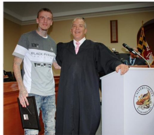
Figure 2 - Calvert County Adult Drug Court Judge Mark Chandlee with a Recent Drug Court Graduate.

Drug courts constitute a Judiciary-led, coordinated system that demands accountability of staff and court participants and provides immediate, intensive, and comprehensive drug treatment, supervision, and support services using a cadre of incentives and sanctions to encourage participant compliance. Drug courts represent the coordinated efforts of criminal justice, behavioral health, and social service agencies, along with treatment communities that actively intervene in, and break the cycle of substance abuse, addiction, and crime. As an alternative to less effective interventions, such as incarceration or general probation, drug courts quickly identify substance-abusing offenders and place them under strict court monitoring and community supervision coupled with effective, individually assessed treatment, and ancillary services. Table 2 provides a comprehensive list and basic characteristics of all Maryland adult, family, and juvenile drug courts, and DUI courts