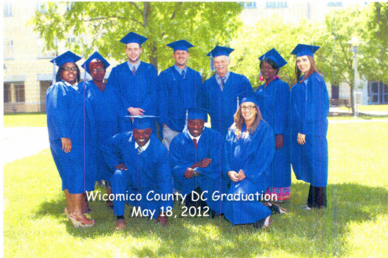
Wicomico County Circuit Court Adult Drug Court Graduates

Drug courts are a judicially led, coordinated system that demands accountability of all participants and ensures immediate, intensive and comprehensive drug treatment, supervision and support services using a cadre of incentives and sanctions to encourage participant compliance. Drug courts represent the coordinated efforts of the criminal justice agencies, mental health, social service, and treatment communities to actively intervene and break the cycle of substance abuse, addiction, and crime. As an alternative to less effective interventions such as incarceration or general probation, drug courts quickly identify substance-abusing offenders and places them under strict court monitoring and community supervision, coupled with effective, individually assessed treatment services.