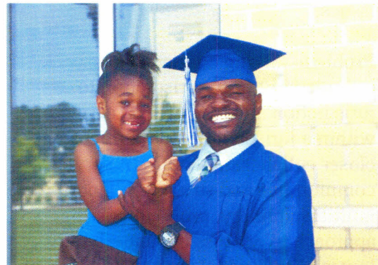
Wicomico County Circuit Court Adult Drug Court Graduate and His Daughter

In 2002, the Maryland Judiciary established the Drug Treatment Court Commission (Commission) for the purpose of supporting the development of drug court programs throughout Maryland. The Commission led the Judiciary's effort to operate and maintain drug court programs in the State. Commission members included: Circuit and District Court Judges, legislators, representatives from the Department of Health and Mental Hygiene, the Department of Juvenile Services, the Department of Public Safety and Correctional Services, State's Attorney's Offices, the Office of the Public Defender, and the Governor's Office of Crime Control and Prevention.