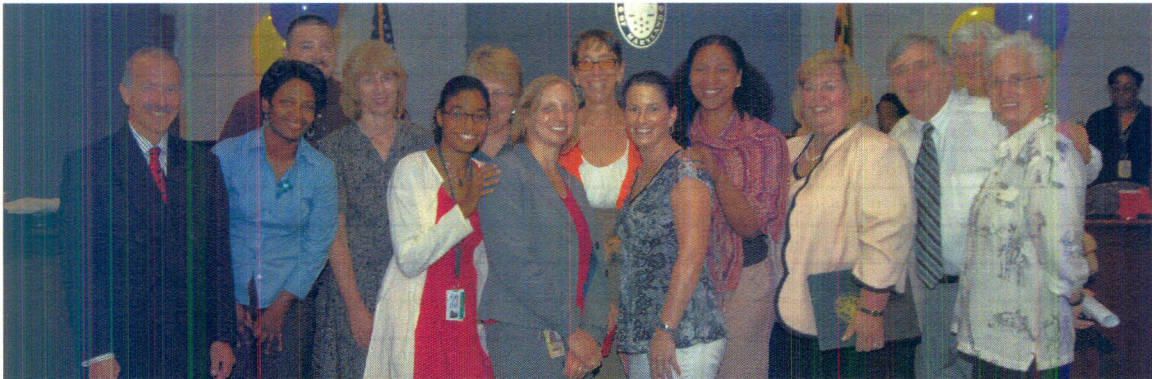
Baltimore City Mental Health Court Team

*For those program participants who were discharged (Completed, Unsuccessful, or Neutral) from mental health courts during FY 2012