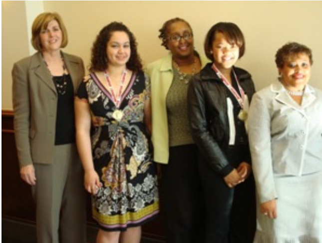
Prince George’s County Truancy Court Graduation

Truancy reduction programs were initiated through legislation in 2004. The initial Truancy Reduction Pilot Program (TRPP) only involved the First Judicial Circuit (Dorchester, Somerset, Wicomico, and Worcester Counties). Participating students are ordered to attend school, complete mandatory projects, and to report to court on time for regular review hearings. The students are held accountable for their actions and may be provided incentives for success, or sanctions for non-compliance.