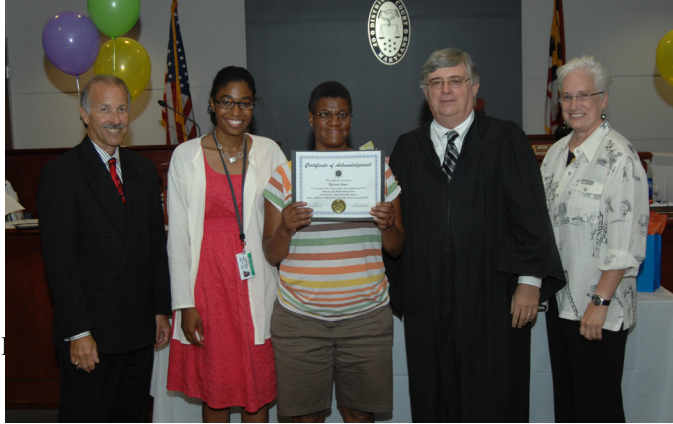
Baltimore City Mental Health Court Acknowledgment Event

A mental health court is a specialized court docket established for defendants with mental illness that substitutes a problem-solving approach for the traditional adversarial criminal court processing. Participants are identified through mental health screening and assessments and voluntarily participate in a judicially-supervised treatment plan developed jointly by a team of