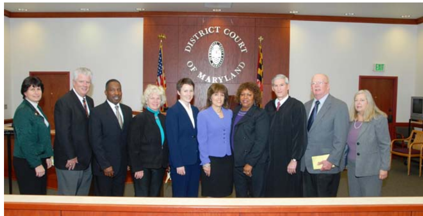
Howard County DUI/Drug Court Team with Orioles Great, Scott McGregor

Juvenile drug court program produced a 23% reduction in arrest rates and a 22% reduction in the number of new arrests over 18 months (from program entry). The average graduation rate for the juvenile programs was 53%. Their reduction in positive urinalysis tests was 69%.