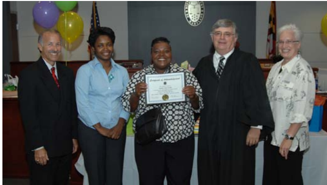
Baltimore City Mental Health Court Acknowledgement Party

The Mental Health Court still functions as a court under the authority of the judge. However, there are notable differences in the manner in which the court oversees cases. The central difference between these “problem-solving courts” and “business as usual” court settings is largely seen in the specialized and intense nature of the court’s oversight of cases and its collaboration with other public agencies to adjudicate and monitor those cases.