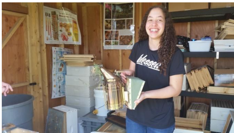
Frederick CTC Student with Bee Smoker

Summary: The mission of the Frederick Career and Technology Center (CTC) and Future Farmers of America (FFA) Alumni Association is to support and advocate for agricultural education and the Future Farmers of America (FFA) through gifts of time, talent and financial resources at the local, state and national levels.