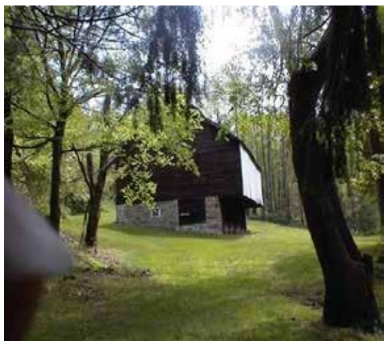
Evergreen Barn Project

Program Funds: MAERDAF funding has trained a cohort of 15 Community Health Workers (CHWs) to meet demands of current health care deficit on the Eastern Shore. Assistance in job placement was provided for all trained CHWs upon training completion.