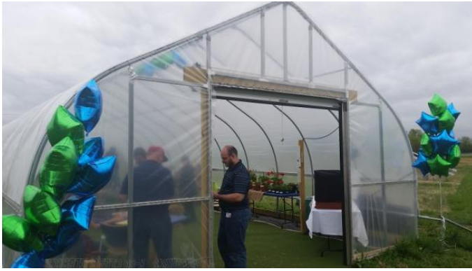
Hoop House and Flower Sale, Photo Courtesy of Chesapeake College Foundation