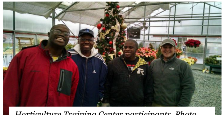
Horticulture Training Center participants

Summary: Delmarva Community Services, Inc. (DCS), is a multi-service, nonprofit agency dedicated to helping people who wish to maintain dignity, and an independent lifestyle within their community on the Delmarva Peninsula.