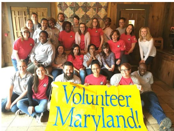
Volunteer Maryland Coordinators

Program Funds: MAERDAF funding provided building and equipment needs to further expand educational and operational activities at Frostburg Grows. Funding supported the purchase of a compact tractor with front-end loader, and construction of a 24’ x 40’ multi-purpose building site on Frostburg Grows.