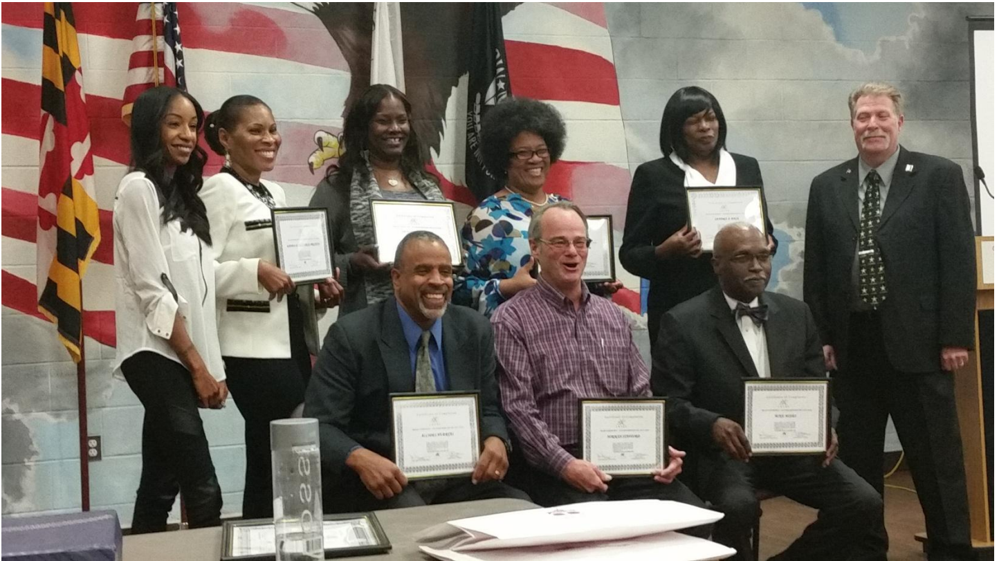
Project Opportunity, 2016 Fall Graduation Ceremony

MAERDAF is administered by: Rural Maryland Council 50 Harry S. Truman Parkway Annapolis, Maryland 21401 Phone: 410.841.5772