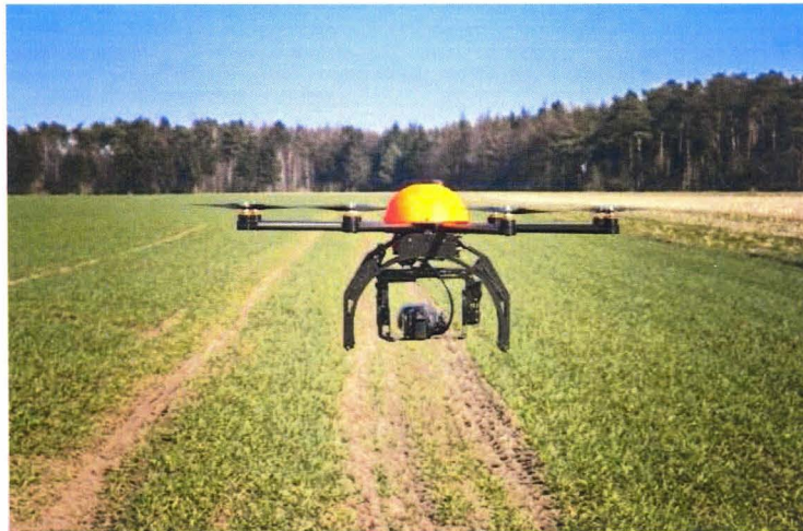
Rotocraft technology being studied for unmanned aerial agriculture

Grant funds were to be used to determine the feasibility of and develop a plan for an agricultural based technology transfer assistance program. The requested funds will be used to document high potential agricultural technologies and cultivars from the USDA’s Agriculture Research Office of Technology Transfer for use, licensing, and commercialization by entrepreneurs and small ag-related businesses in Southern Maryland’s tri-county region.