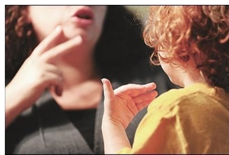
Language and Communication Videos

How long can a child keep hearing aids from the Loan Bank? The standard length of time is 12 months with up to a 12-month extension.