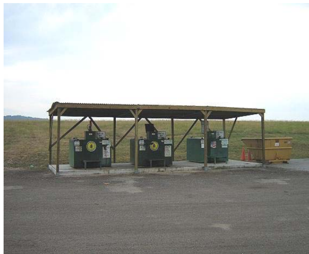
BALTIMORE COUNTY RESOURCE RECOVERY FACILITY

Submitted by: Maryland Environmental Service