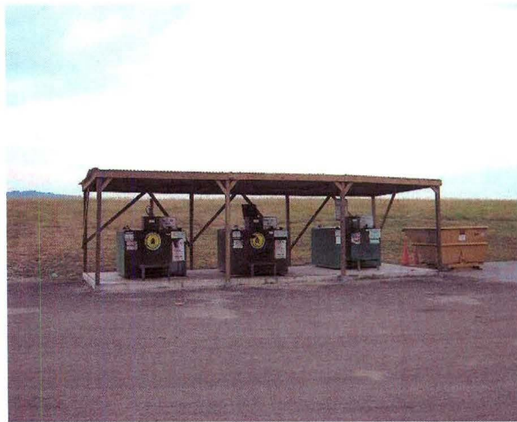
BALTIMORE COUNTY RESOURCE RECOVERY FACILITY

Submitted by: Maryland Environmental Service