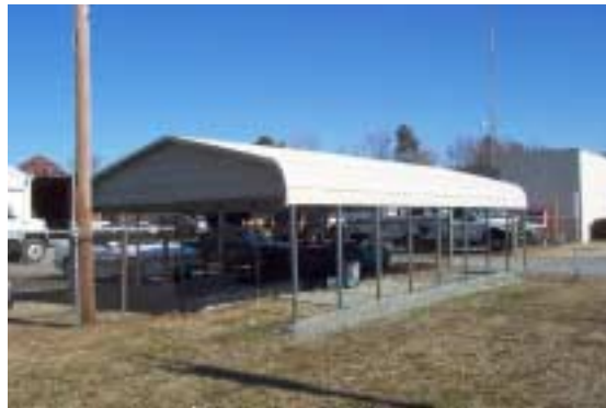
City of Cambridge