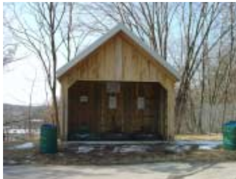
Town of Sykesville