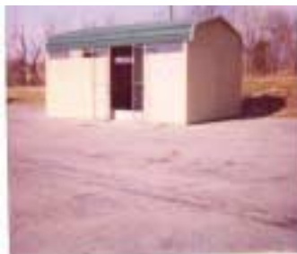
Town of Boonsboro