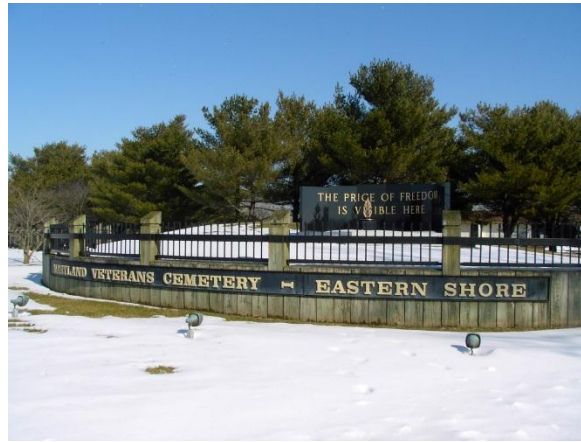
Pictured above: Eastern Shore Veterans Cemetery Entrance