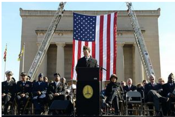
Lt. Governor Anthony G. Brown attends the Veterans Day Remembrance Ceremony, War Memorial Building, Baltimore (November 11, 2013)

The War Memorial Commission shares custody and supervision of the War Memorial Building and the War Memorial Plaza with the City of Baltimore. Both were erected in 1927 in Baltimore to honor Marylanders who died in World War I. The War Memorial Building lies directly across from City Hall. The Memorial welcomes approximately 2,900 visitors each month. Maintenance costs are shared equally by the State of Maryland and the City of Baltimore. The Commission meets quarterly and consists of ten members who serve five-year terms; five are appointed by the Secretary of Veterans Affairs with the Governor's approval, and five by the Mayor of Baltimore.