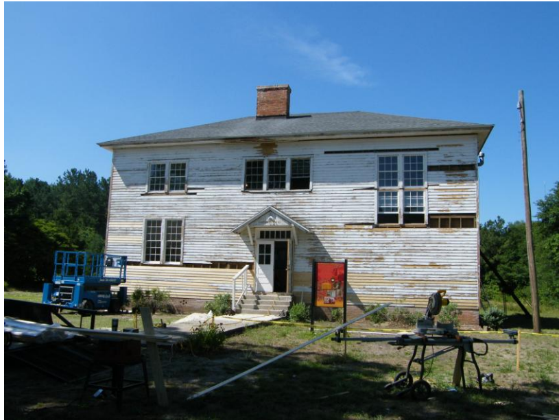
San Domingo Rosenwald School, Wicomico County

Maryland Commission on African American History and Culture 84 Franklin Street Annapolis, MD 21401 www.africanamerican.maryland.gov