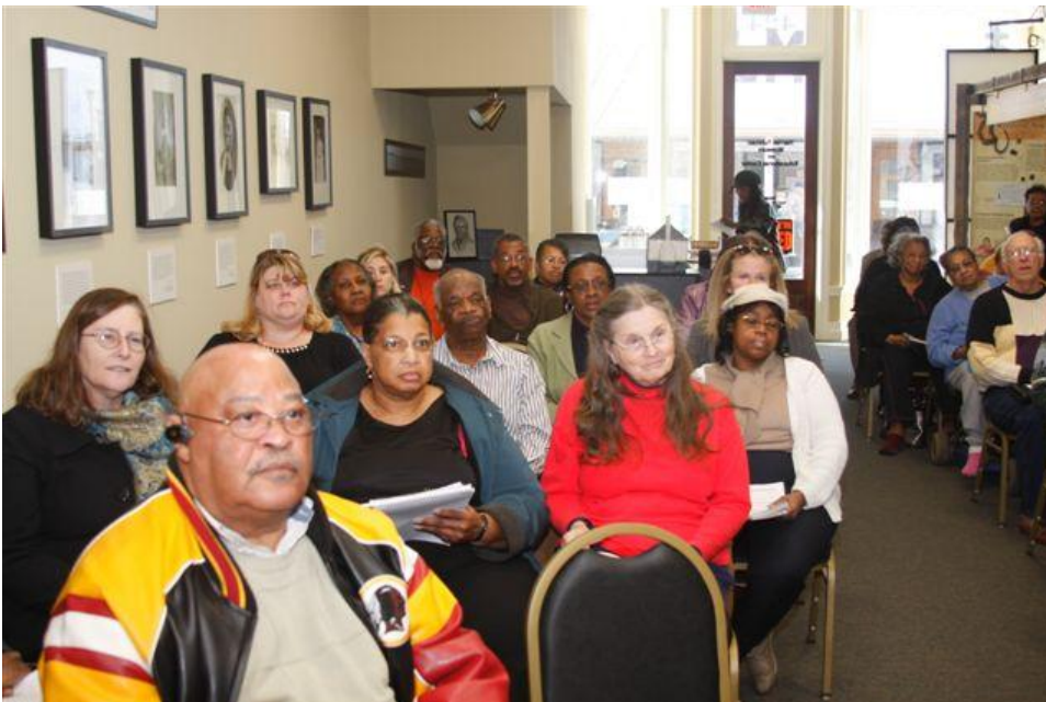
Attendees at the AAHPP grant workshop at the Harriet Tubman Museum in Cambridge, Maryland, in March 2011.

These workshops, which were specific to this grant program, reached and informed well over 100 interested individuals. Throughout the spring and summer, MHT and MCAAHC staff responded to specific inquiries from potential applicants and provided guidance about the application process.