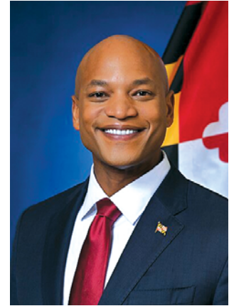
GOVERNOR WES MOORE

The strategic plan represents our commitment to helping Marylanders with autism achieve their highest potential and lead fulfilling lives in their communities. The work will rely on collaboration among state and local government, autistic people, families, private organizations, providers, and more—and we're grateful for such dedicated partnership. We sincerely appreciate your support as we work to advance Maryland as a leader in delivering autism-related services and supports. You are helping us build a brighter future for all Marylanders, ensuring we leave no one behind.