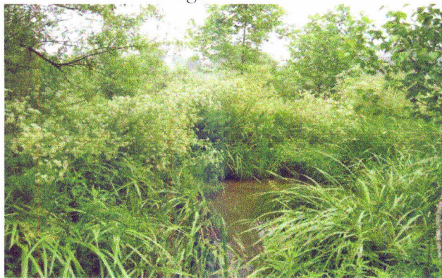
Hood Programmatic Mitigation Site, Frederick County

Wetlands and Waterways Program Water Management Administration