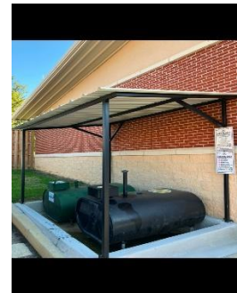
Brunswick Public Works

In 2024, 467,452 gallons of used oil and 31,134 gallons of used antifreeze were collected from Program sponsored locations. Additionally, during this period, 128 drums of used oil filters were collected for recycling.