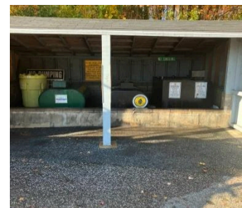
Aberdeen Public Works

The total cost for MES to implement the program in FY24 was $244,065.41. The collection contract provides revenue per gallon for collected oil based on a federal commodity index. In FY24, the program was completely self-funded by commodity revenue.