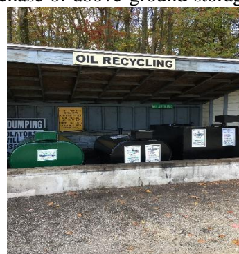
Town of Thurmont

During 2020, 415,739 gallons of used oil and 32,739 gallons of used antifreeze were collected from Program-sponsored locations. Additionally, during this period, 155 drums of used oil filters were collected for recycling.