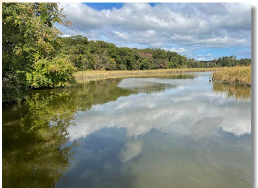
Charles County Farm

Established in 1977, and has since grown into one of the most successful programs of its kind in the country.