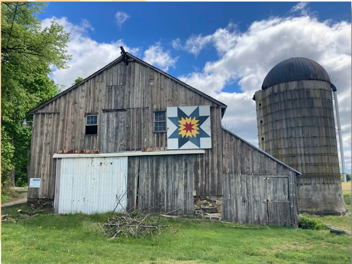
Harford County Farm

As a stakeholder, MALPF is working with the Smart Growth Subcabinet to develop and publish a plan (the Plan) to meet the State’s conservation goals. The Plan is due July 1, 2024, and shall be updated as needed, but not less than every five years. In addition to the Plan, an annual report on the State’s progress toward meeting the conservation goals is due beginning December 1, 2024.