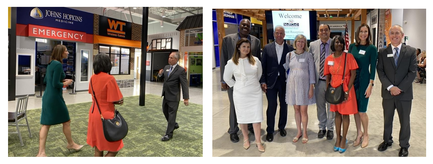
Attendees of the GWDB reception at JA BizTown in September 2022

on September 21, 2022. Board members along with valued partners, including Local Workforce Development Board representatives, CTE Committee members, and State Agency partners from the Maryland Department of Labor, Maryland State Department of Education, and the Accountability & Implementation Board, mingled and toured the new JA BizTown facility. JA BizTown gives students exposure to the world of work, as a facility where middle school students have an opportunity for hands-on, real world learning within a simulated town, from operating a bank to managing a restaurant.