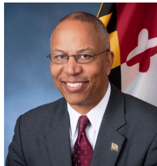
Boyd K. Rutherford Lt. Governor