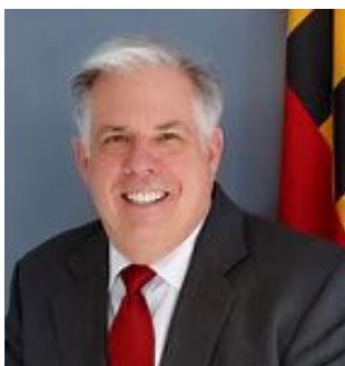
Larry Hogan Governor