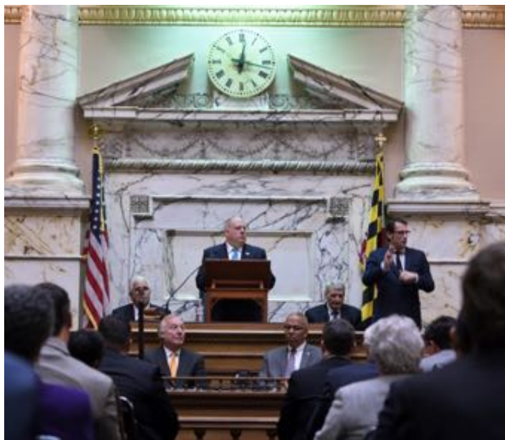
Governor Larry Hogan delivers his 2017 State of the State address. The address was interpreted by a Certified Deaf Interpreter team.