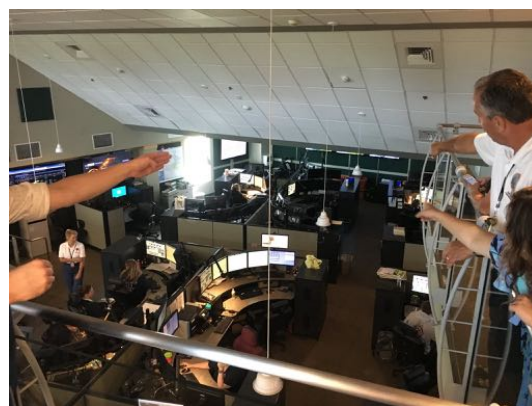
A demonstration of how the text-to-911 process works at the Frederick County Division of Emergency Management's PSAP floor, where their emergency calls are received and handled.