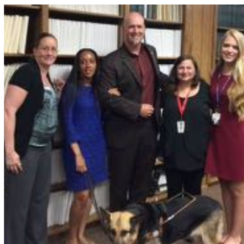
Right: Office staff with Haben Girma, the keynote speaker for the Maryland Department of Disabilities' 26 th ADA anniversary and the first DeafBlind graduate of Harvard Law School.