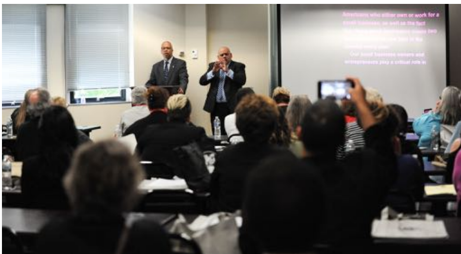
Lt. Governor Boyd Rutherford shares his remarks with Deaf and hard of hearing business owners at the Deaf Business Summit, emphasizing Maryland's commitment to the Deaf Ecosystem.

To read the full press release, please see: odhh.maryland.gov/press-releases/deaf-business-summit-2017/ .