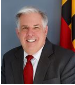
Larry Hogan Governor

Maryland State House 100 State Circle Annapolis, Maryland 21401 410-974-3901