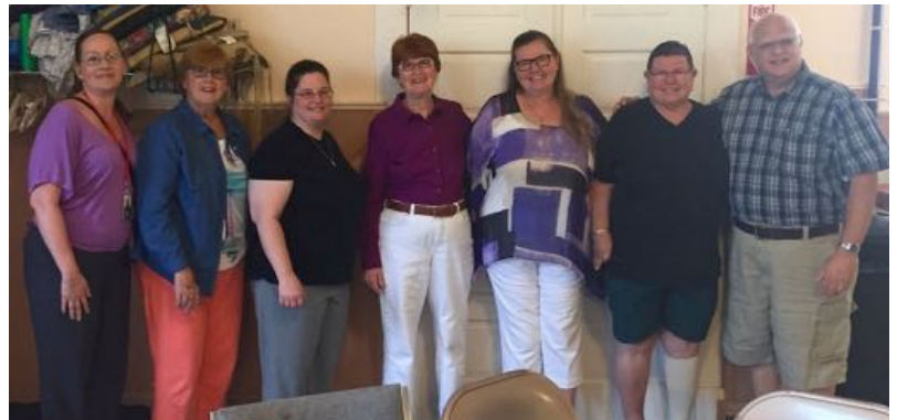
The office helped connect Maryland Deaf Senior Citizens, Inc. with Deaf Shalom Zone in Baltimore to explore the possible use of Deaf Shalom Zone's facility as a venue for community events and social gatherings.