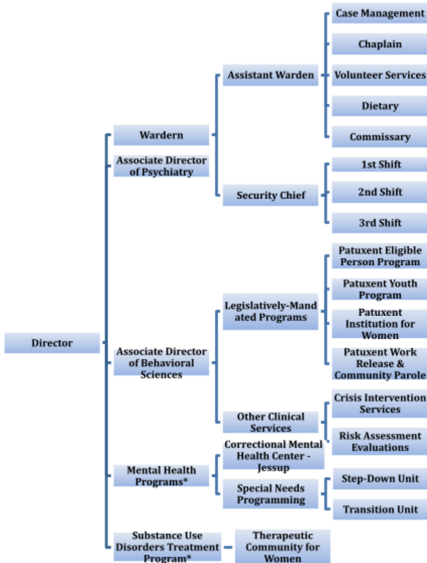
Patuxent Institution Organizational Chart

* Because the mental health programs and the substance use disorders treatment program are housed at Patuxent, they fall under the institution's organizational chart. However, they are supervised by the DPSCS' director of mental health and director of substance use disorders treatment services, respectively.