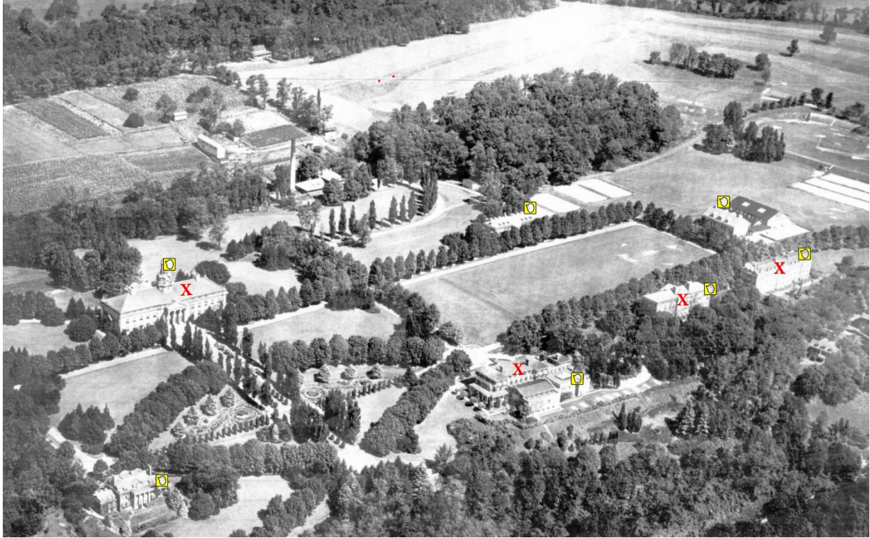
Aerial view of Tome School Historic District. Structures marked with a red X indicate those properties that have suffered from arson. From left to right, those structures include: Memorial Hall (September 2014), Tome Inn (May 2020), Jackson House (condemned), and Harrison House (June 2020).