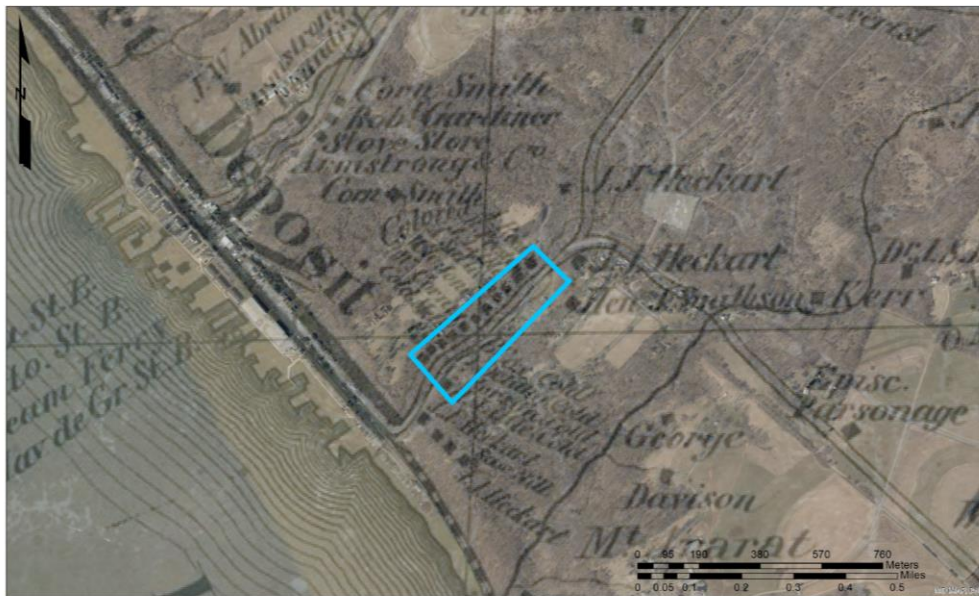
Snow Hill Community Boundary based on 1858 Martenet Cecil County Map

The blue rectangle shows the approximate location of Snow Hill, a Free Black community established in the Port Deposit area by the mid-1800s which remained intact until the end of the nineteenth century. This archaeological site has been determined eligible for listing on the National Register of Historic Places.