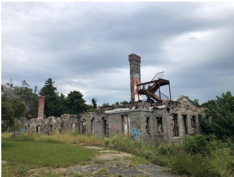
Photo: Former building on the Tome School property that has been damaged by fire and vandalism as observed by the Advisory Committee. (Sept. 2022) Snow Hill Archeological Site

Presently, the structures lie in varying stages of decay, deterioration and blight. Recent vandalism and fires have taken an even greater toll on the structures.