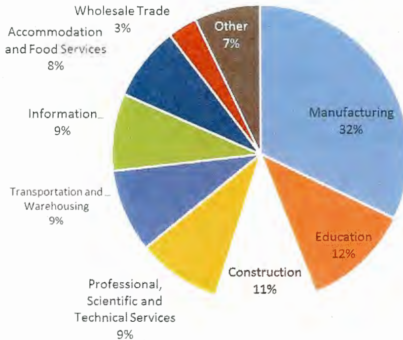
Commerce Incentives by Industry, FY 2018

The mix of industries changes every year based on demand but in general, the majority of assistance goes to the professional and technical services sector and to manufacturing. In FY2018, Manufacturing received the largest dollar amount with 32 percent of total assistance. Education received 12 percent of assistance and construction 11 percent. Professional, scientific, and technical services companies received 9 percent of total assistance. These include many technology companies such as those in biotech research, information technology and cybersecurity, as well as professional services and engineering.