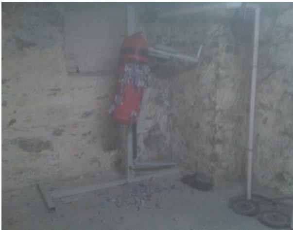
BASEMENT BEFORE RENOVATION

The basement was under-utilized for years due to decrepit conditions and inadequate ventilation but the area was renovated during 2011 to provide for indoor recreation space (see pictures below).