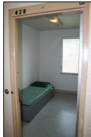
Sleeping room used for Intensive Behavior Management

It is not possible to determine how many youths have been subjected to this type of extended isolation because program records are kept only in individual youth files. Outcomes are not documented.