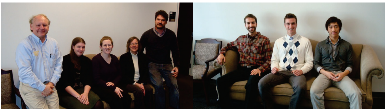
Community College of Baltimore County-Catonsville Team