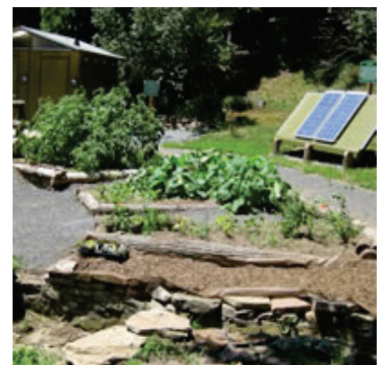
Evergreen Heritage Center