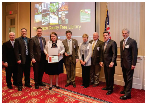
The Alice Virginia and David W. Fletcher Branch of the Washington County Free Library receives the award