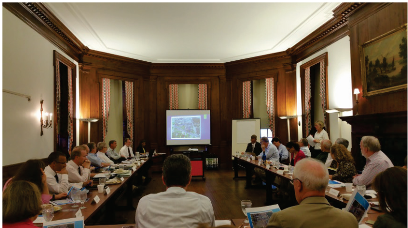
The 36-member Maryland Sustainable Growth Commission meets bi-monthly at various locations around the state. Pictured above the Commission held its May 11 th meeting at the Donaldson Brown Conference Center in Port Deposit (Cecil County)

The Commission continues to investigate metrics on community data that can provide decision makers a comprehensive view of their community profile. The Commission's concentrating growth working group has coordinated this initiative among state agencies, local governments and the Center for Smart Growth.