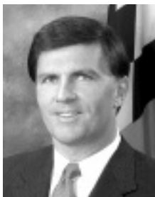
Robert L. Ehrlich, Jr.