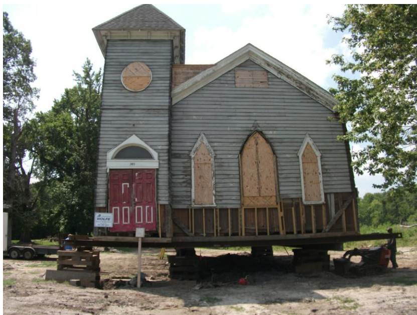
Christ Rock Church, Dorchester County

Maryland Commission on African American History and Culture 84 Franklin Street Annapolis, MD 21401 www.africanamerican.maryland.gov