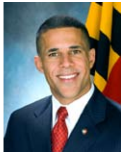
Anthony G. Brown Lieutenant Governor