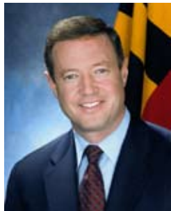
Martin O'Malley Governor