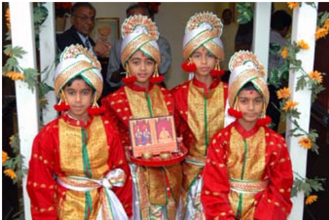
Asian Indian children celebrating Janmashtami.

At each location, Asian Pacific American seniors with limited English proficiency received a presentation in their native language regarding the Medicare D Prescription Drug Program. The Office and Commission also recruited and helped train bilingual volunteers, who followed up several weeks after the presentations to provide on-location counseling and internet enrollment for the seniors.