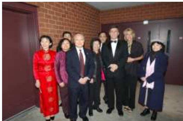
2005 Lunar New Year Celebration (Year of the Rooster)