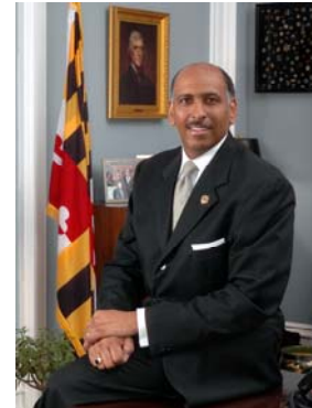
The Honorable Michael S. Steele Lt. Governor