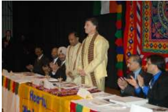
Governor Robert L. Ehrlich, Jr. dresses for the occasion as India celebrates its 75 th Anniversary on January 29, 2005.