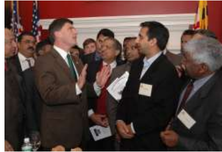
Asian Indian CEOs Meeting with Governor Robert L. Ehrlich, Jr. held on January 25, 2005.