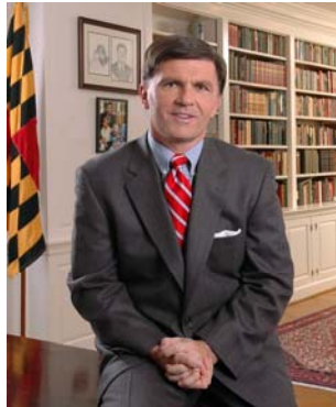
The Honorable Robert L. Ehrlich, Jr. Governor